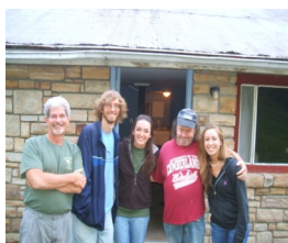
Chapel Center Mission Team at St Timothy's Outreach Center, Irvine, KY

Mission team members from the University Chapel Center @ USF recently traveled to Irvine, Kentucky to assist the Episcopal diocese of Lexington with outreach efforts in eastern Kentucky.